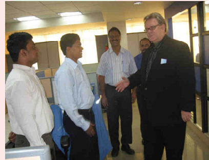
POSCO Board Members in discussion with Indian employees