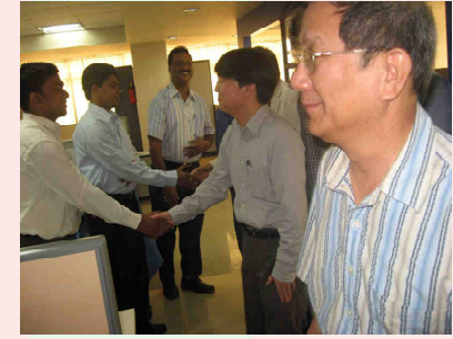
Board Members being greeted at Bhubaneswar Corporate office. CMD, POSCO-India looks on.