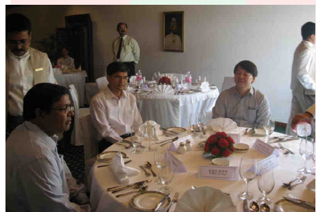
Power Lunch: POSCO Board members' luncheon with POSCO-India senior executives