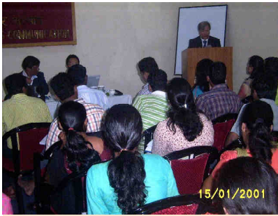
Students in rapt attention at IIMC

Q: How much product do you plan to export?