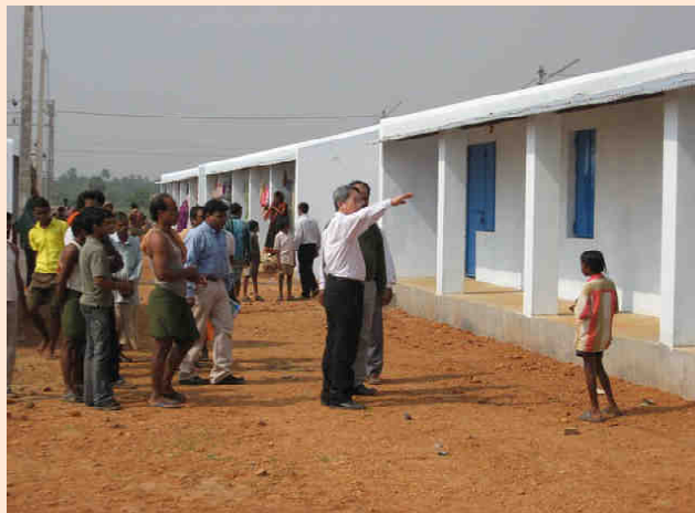
POSCO-India officials with the displaced families at the transit camp

These families were living at Bhutmundai camp since July 2007 and POSCO-India was providing necessary support for food, health and education of the villagers.