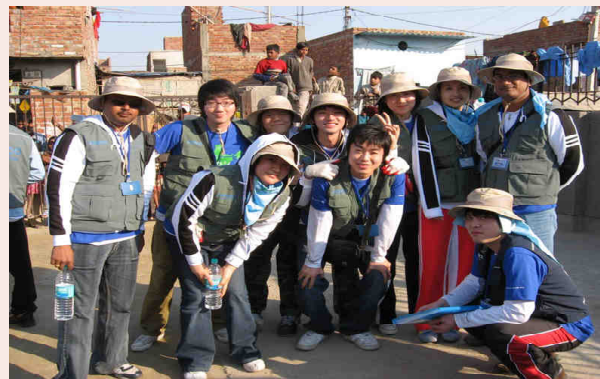
Youth Volunteers from S.Korea at the Construction site

Due to language handicap, initially our Korean friends were little hesitant to mix-up, but gradually they