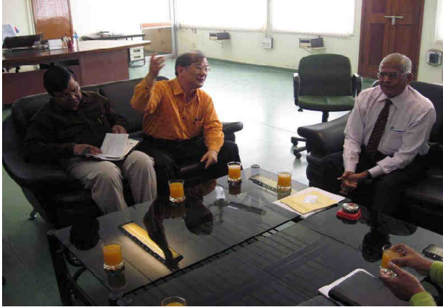
CMD in discussion with CRRI Director