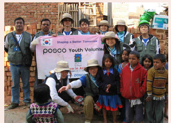
Volunteers with the campaign banner

higher cause. But the memories and the experience we had there and the satisfaction we had for doing whatever little we could have for the poor will last forever.