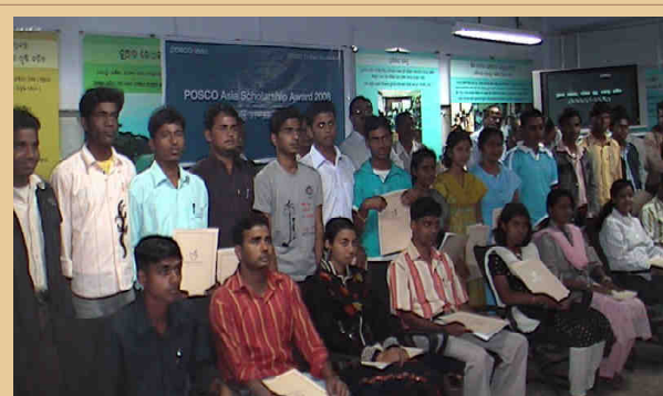
Scholars with their citations at Kujang office

28 meritorious students from the three Gram Panchayats of Nuagaon, Gadakujang and Dhinkia falling under the proposed site of POSCO-India steelworks, were awarded fellowship for 2008 by POSCO TJ Park Foundation, S.Korea, in a function held at POSCO-India Kujang Office. Children