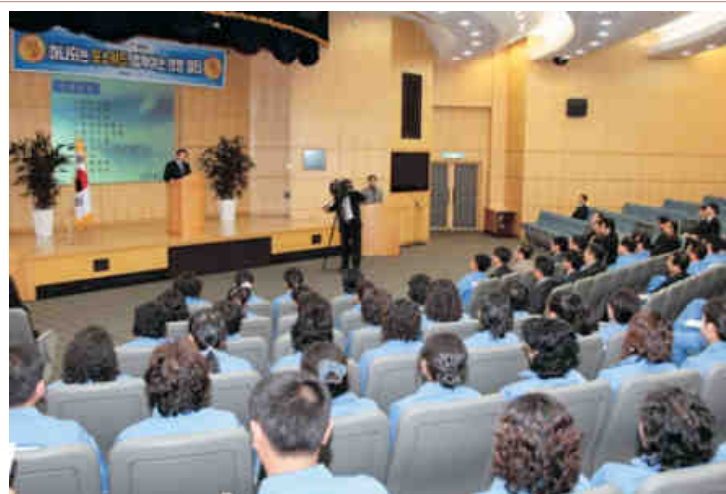
Inauguration of POSWITH

The major business areas of POSWITH covers the departure works of the staffs performing in POSCO's partner and