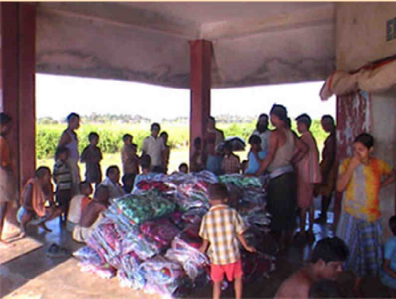
Warmth in winter: POSCO-India distributes blankets at Balitutha temporary shed as winter sets in