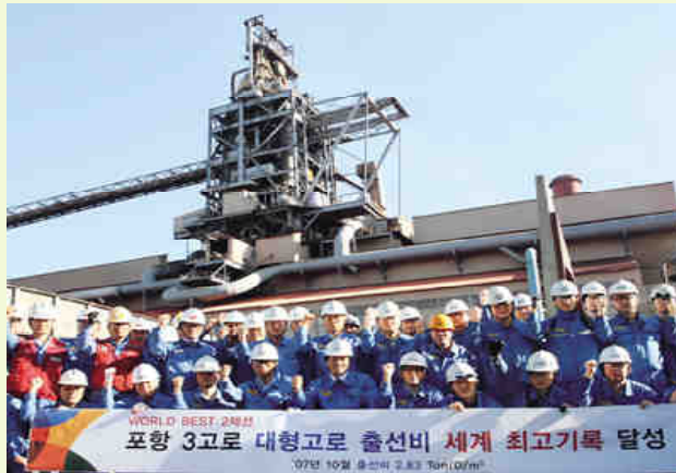
Pohang Works Steel manufacturing department celebrating new world record in front of the third blast furnace

Pohang Works' steel manufacturing department used up to 190 kg of grained coal per one ton of molten metal, instead of coke which is more expensive material, to realize low cost and highly efficient production. In addition, it achieved the operation through enhancing its product quality by lowering the silicon level.