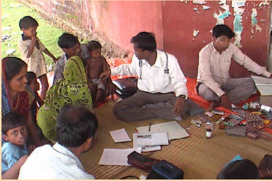
Health Check-up: Medical Officer checking patients at Bhutamundeï temporary shed on his weekly visit