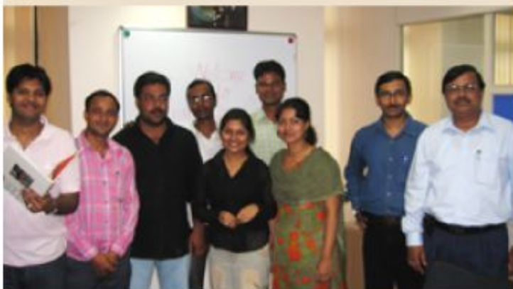
Members of POSCO-India family, after inauguration of in-house Library