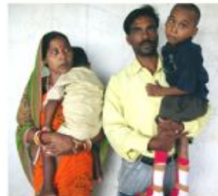
A family ready for rehabilitation

Forty two families of Patanasahi, Dhinkia braved all odds and came out openly in favour of the POSCO-India project. They have offered their homestead land and agricultural land for the project and have willingly moved out of the village.