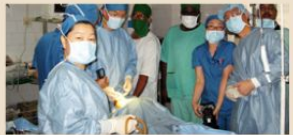
Surgery in Progress: 19 cleft lip and 7 cleft palate surgeries conducted