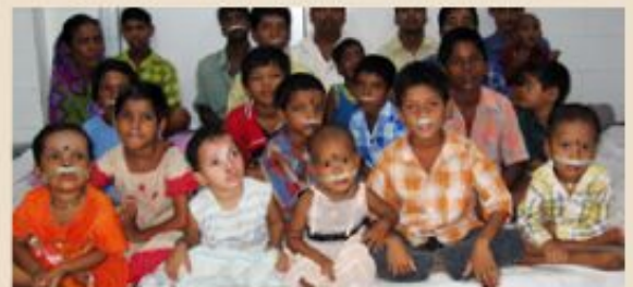
Success Repeated: Children who benefited from this Specialized Surgery Camp