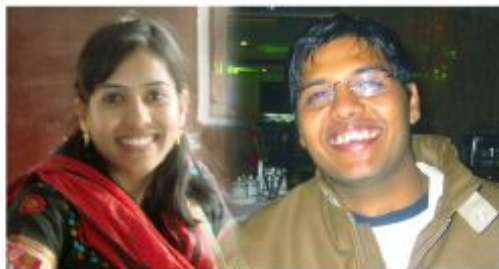
The Girl, for whom I abdicated my bachelorhood

No matter where you look, from movies to magazine ads, men are always being told that they need a woman to be happy and I was the last person to believe it. 'Me' a die-hard bachelor, who always believed that to be 'Single' is the best thing in this world with liberties such as, you can gain weight without worrying; you can be your own boss and so on. And the brightest side of solitude is you can flirt as you please.